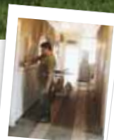
The Top floor before...

During the last year our landlord has carried out a great deal of work on the roof of the building and now this has been completed it has allowed us to refurbish the top floor of Senior School building. Lockers have been removed and relocated, partition walls removed to allow more light onto the corridor and restoration of plasterwork was also carried out. All the electrics on this floor were upgraded and finally complete redecoration and new carpeting was finished before we started back at school in September.