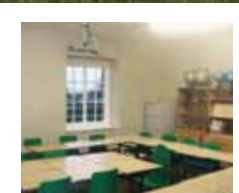
The Geography Room...

During half term in October the Geography room was re-decorated and two more classrooms on this floor will be re-decorated after Christmas.