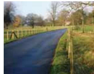
The Driveway after...

During the last year our landlord has carried out a great deal of work on the roof of the building and now this has been completed it has allowed us to refurbish the top floor of Senior School building. Lockers have been removed and relocated, partition walls removed to allow more light onto the corridor and restoration of plasterwork was also carried out. All the electrics on this floor were upgraded and finally complete redecoration and new carpeting was finished before we started back at school in September.