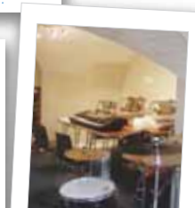
The New Music Practice Room...