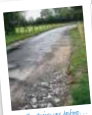
The Driveway before...