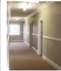
The Top floor after...

During half term in October the Geography room was re-decorated and two more classrooms on this floor will be re-decorated after Christmas.