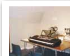
The New Music Practice Room...

In the cellars, a much needed Music Practice Room was created and some outbuildings behind the HE room were removed.