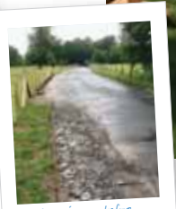
The Driveway before...